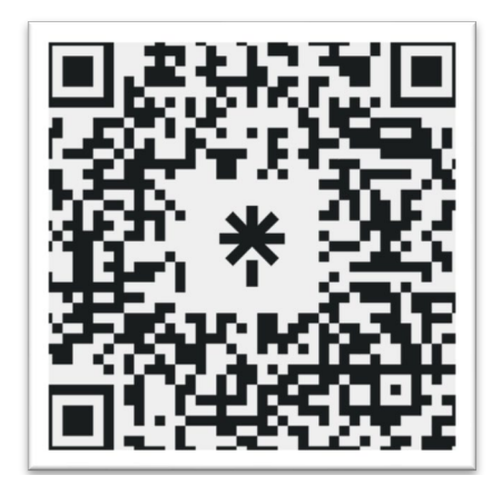
Scan here for more information about the Alliance to Advance Climate-Smart Agriculture!

106A Hutcheson Hall 250 Drillfield Drive Blacksburg, Virginia 24061