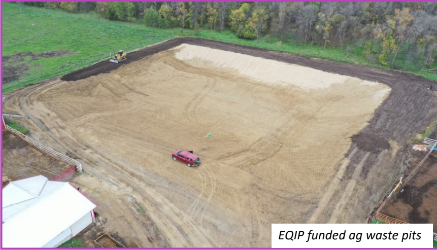
EQIP funded ag waste pits